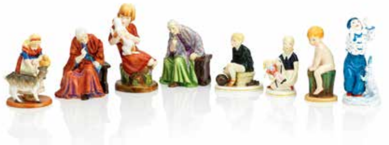
92 A SELECTION OF ROYAL WORCESTER FIGURES 1930s - early 1950s Including two examples of The Fortune Teller, The Old Goat Woman, Pupée, Young England, etc (8) £200 - 300 €230 - 340

See Bonhams.com for further footnote on this lot