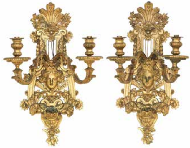
435 A SET OF FOUR LATE 19TH CENTURY ORMOLU WALL APPLIQUES Cast with twin branch sconces protruding from a central mask on a pierced mount with cornucopia and symbolic devices, (now electrified), 35cm wide, 23cm deep, 51cm high (13 1/2in wide, 9in deep, 20in high). (4) £1,000 - 1,500 €1,100 - 1,700