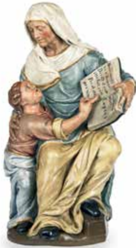
327 A LARGE POLYCHROME-PAINTED AND CARVED SCULPTURE, PROBABLY ST. ANNE TEACHING THE CHRIST CHILD TO READ , SOUTHERN EUROPEAN The Virgin seated and holding an open book, the pages painted in black with the words 'Omnis sapientia a Domino Deo est et cum itto fuit semper et etia aevum / Cectesiastici Cap. I. V. I', the verse from Ecclesiasticus, 78cm high (30 1/2in high) £200 - 300 €230 - 340