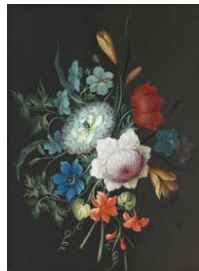
251 G*** H***

A Scotland Forever oil on canvas, 102 x 75cm (40 1/8 x 29 1/2in). £200 - 300 €230 - 340