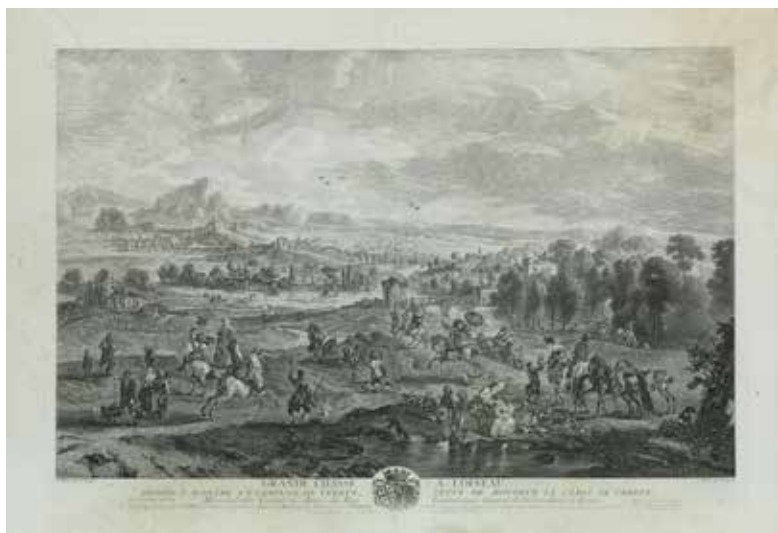
283 BRITISH SCHOOL Quantity of 18 miscellaneous antique engravings and prints (damages) £300 - 500 €340 - 560