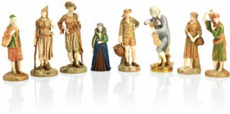
91 EIGHT ROYAL WORCESTER FIGURES by James Hadley and Thomas Brock, late 19th/early 20th century All decorated in shot enamels, 16cm - 23cm high, factory marks £400 - 500 €450 - 560

See Bonhams.com for further footnote on this lot