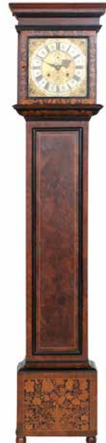
480 A 17TH CENTURY AND LATER WALNUT AND MARQUETRY INLAID LONGCASE CLOCK Inscribed Dam. Le Count, London The square 11in. dial with silvered chapter ring, subsidiary seconds and date aperture the twin train movement striking a bell contained a marquetry floral inlaid case raised on bun feet, 43cm wide, 23cm deep, 209cm high (16 1/2in wide, 9in deep, 82in high) £800 - 1,000 €900 - 1,100