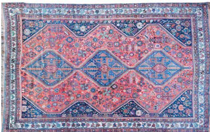
344 A QASHQAI RUG South Persia 229cm x 316cm £600 - 800 €680 - 900