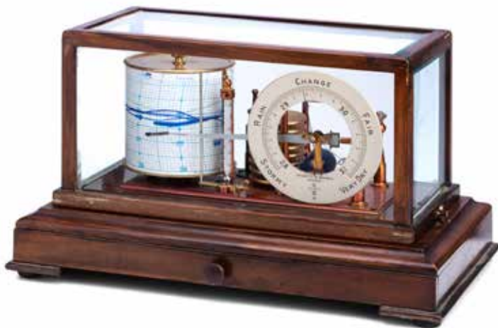
471 AN EARLY 20TH CENTURY MAHOGANY CASED BAROGRAPH

The dial inscribed Negretti & Zambra, London