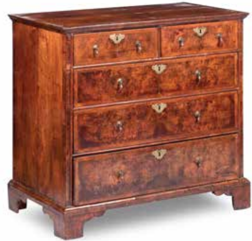
424 A GEORGE II AND LATER WALNUT AND FEATHERBANDED CHEST OF DRAWERS The top above two short and three long graduated drawers raised on bracket feet, 99cm wide, 56cm deep, 93cm in diameter, (38 1/2in wide, 22in deep, (36 1/2in in diameter, £700 - 1,000 €790 - 1,100