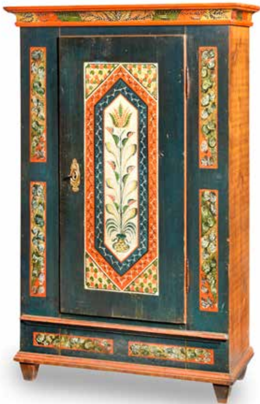
451 A 19TH CENTURY BOARDED PINE AND POLYCHROME-PAINTED ARMOIRE, CENTRAL EUROPEAN, CIRCA 1830 The cavetto-moulded cornice decorated with stylized tulips, above a single door with a large central reserve decorated with a tulip plant filled vase against an indigo ground, flanked by paired reserves of abstract decoration, with scumbled sides, the interior with four shelves, on tapering block feet, 113.5cm wide, 50cm deep, 188cm high (44 1/2in wide, 19 1/2in deep, 74in high). £400 - 600 €450 - 680