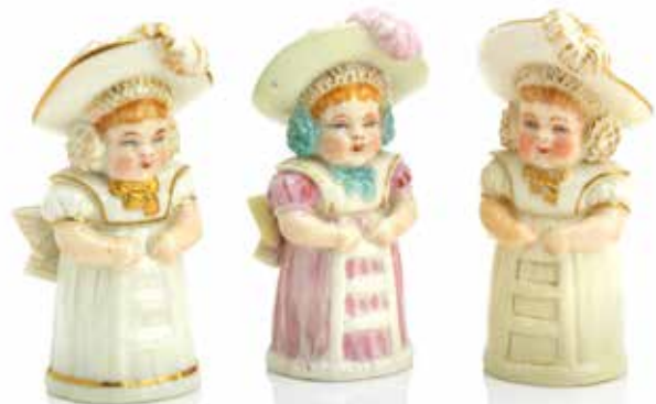
75 THE FEATHERED HAT: THREE ROYAL WORCESTER CANDLE EXTINGUISHERS Circa 1880-90 One fully coloured, the other two both in gilt and tinted decoration, 9.2cm high, factory marks £400 - 600 €450 - 680

See Bonhams.com for further footnote on this lot