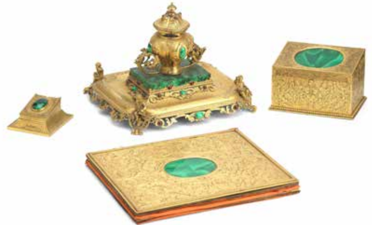
318 A LATE 19TH CENTURY ENGRAVED GILT BRONZE, MALACHITE AND RED GLASS STONE INSET DESK STAND Comprising inkwell and pen stand, stationary box, blotter and stamp holder, the inkstand 27cm wide, 23cm deep, 20cm high (10 1/2in wide, 9in deep, 7 1/2in high), (4) £1,200 - 1,800 €1,400 - 2,000