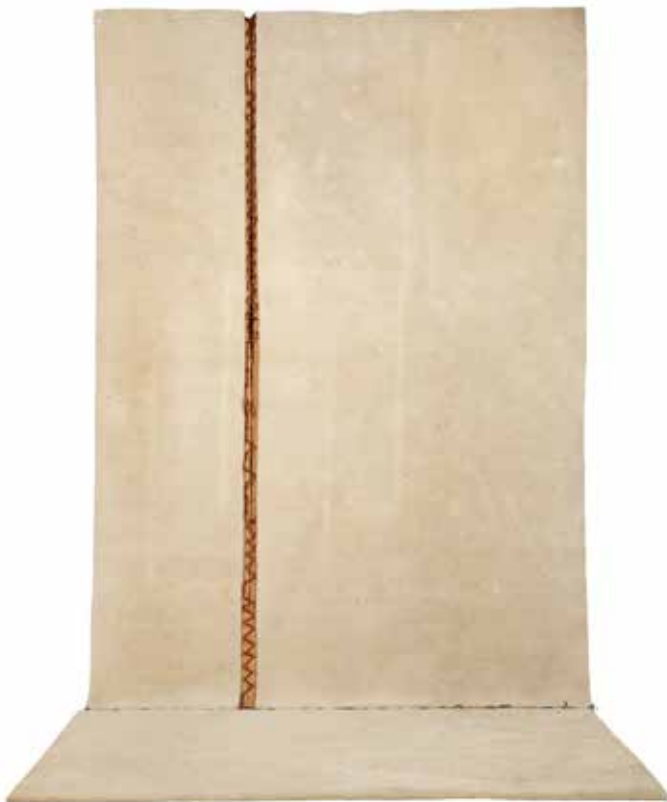
383 AFTER A DESIGN BY BERTHOLD LUBETKIN (RUSSIAN, 1901-1990) A COPY THE ORIGINAL CARPET DESIGNED FOR THE PENTHOUSE AT HIGHPOINT, LONDON Hand-knotted wool pile manufactured by THE RUG COMPANY London, New York, 178cm wide, 387cm high (70in wide, 152in high). £400 - 600 €450 - 680

See Bonhams.com for further footnote on this lot