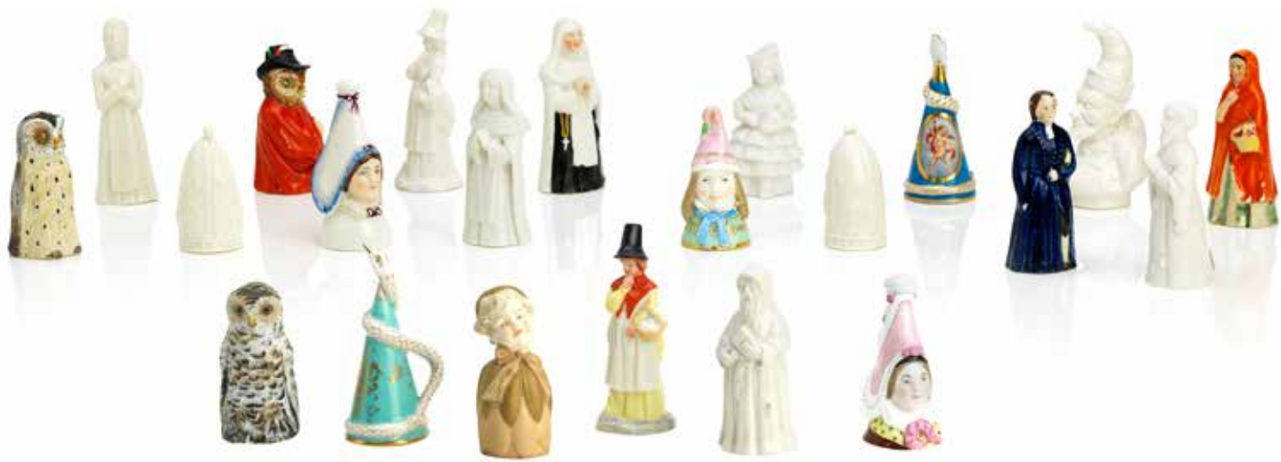
71 A COLLECTION OF ENGLISH AND CONTINENTAL CANDLE EXTINGUISHERS Late 19th/early 20th century Including Goss, Minton and Berlin examples, parian examples, etc tallest 10cm high, various marks, some unmarked (22) £400 - 600 €450 - 680