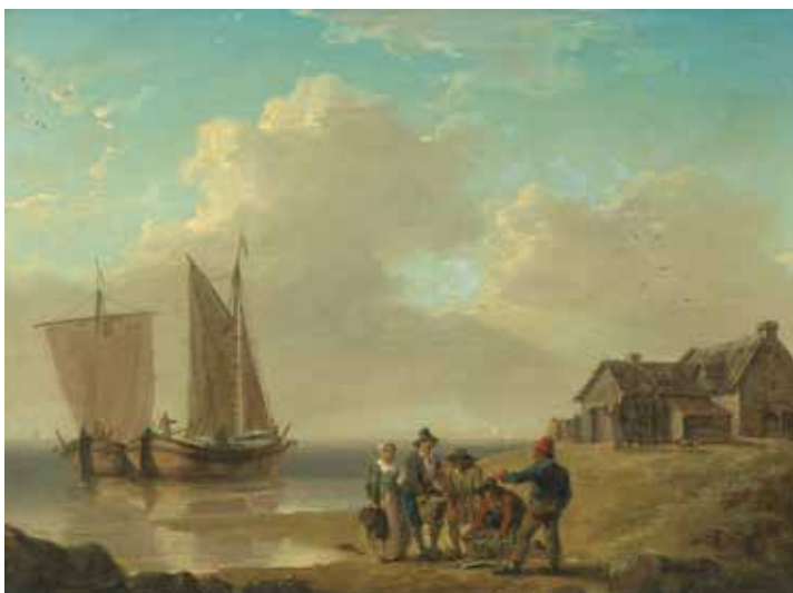
242 ENGLISH SCHOOL, 19TH CENTURY Fisherfolk oil on panel, 20.5 x 27cm (8 1/16 x 10 5/8in). £300 - 500 €340 - 560