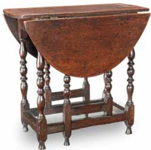
335 A SMALL JOINED OAK GATLEG OCCASIONAL TABLE, ENGLISH, CIRCA 1700 Having an oval drop-leaf top, each leaf a single-board, raised on paired-baluster and ball centred legs, with similar gate turnings, all stretchers with line-incised upper edge, 79.5cm wide, 65cm deep, 60cm high (31in wide, 25 1/2in deep, 23 1/2in high).