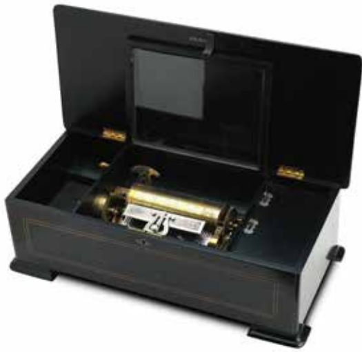
467 A LATE 19TH EARLY 20TH CENTURY ROSEWOOD AND MARQUETRY INLAID Y MUSIC BOX

Playing ten airs, the 19cm cylinder contained in a rectangular case, 42cm wide, 19.5cm deep, 13cm high (16 1/2in wide, 7 1/2in deep, 5in high)