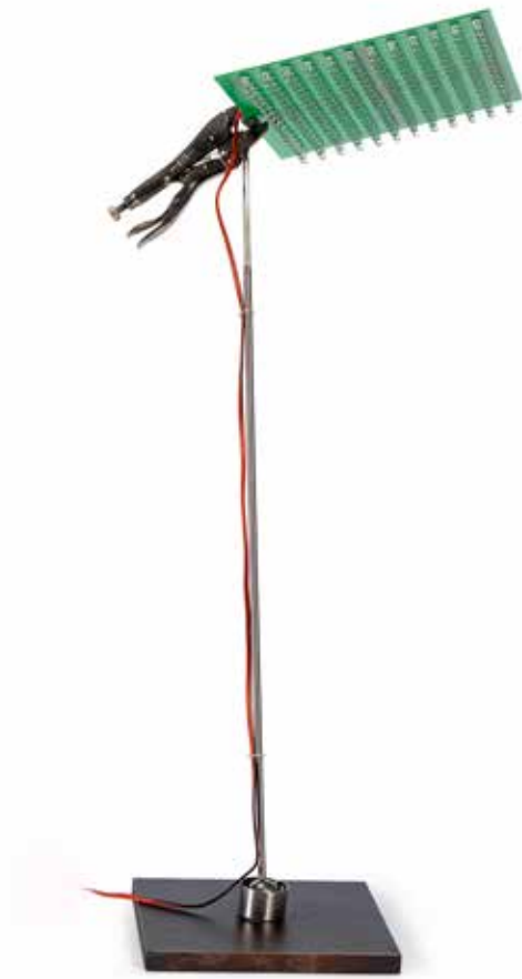
402 INGO MAURER (GERMAN, B.1932) EL.E DEE LAMP , DESIGNED AND MANUFACTURED 2001 Circuit board, steel, ball-and-socket mechanism, vice-grip pliers, signed in pen and dated 2001 37cm x 23cm x 52.5cm £1,000 - 1,500 €1,100 - 1,700