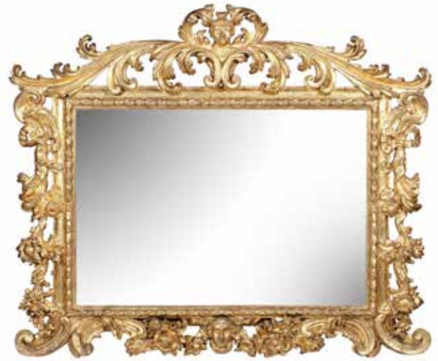
441 A LATE 19TH CENTURY GILTWOOD AND GESSO OVERMANTEL MIRROR The rectangular plate within a frame surmounted by a female mask and foliate scrolls, 170cm wide, 9cm deep, 153cm high (66 1/2in wide, 3 1/2in deep, 60in high). £1,000 - 1,500 €1,100 - 1,700