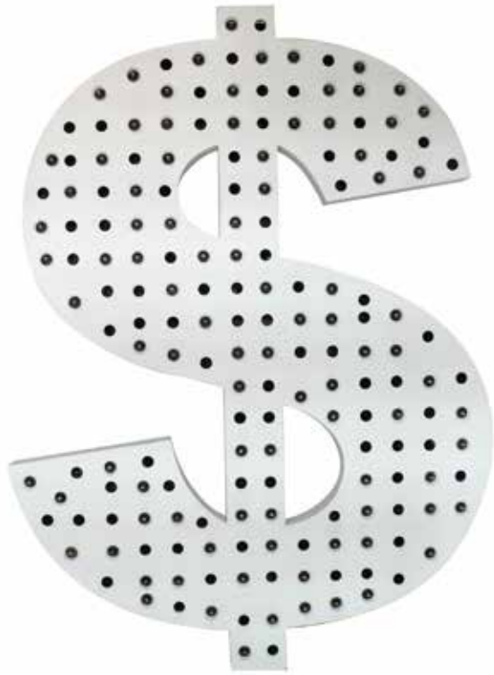
381 NICK KNIGHT (BRITISH B.1958), $, DESIGNED AND EXECUTED IN 2003 AR Painted wood, 25W bayonet lightbulbs, 151cm wide, 207cm high (59in wide, 81in high). £1,000 - 1,500 €1,100 - 1,700

See Bonhams.com for further footnote on this lot