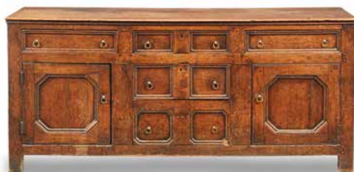
339 A WILLIAM & MARY JOINED OAK FULLY-ENCLOSED DRESSER BASE, CIRCA 1700 The boarded top with ovolo-moulded edge, the front with a T-shape arrangement of drawer fronts, the lowest being a dummy drawer, flanked by a panelled cupboard door, and all with applied mitred-mouldings, on stile feet, 181cm wide, 44cm deep, 86cm high (71in wide, 17in deep, 33 1/2in high).