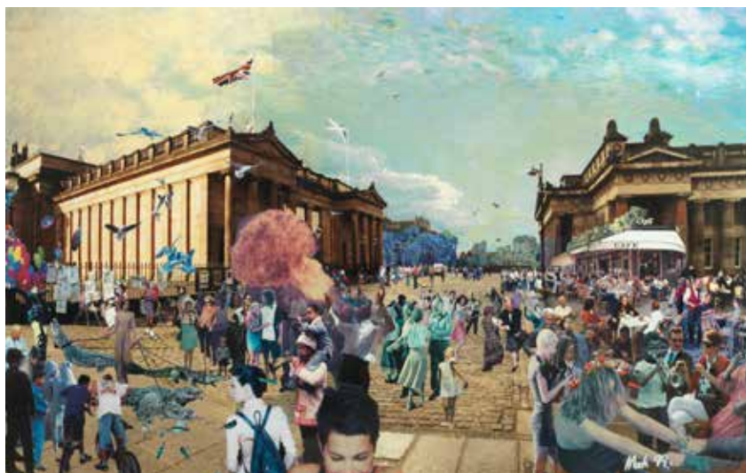
247 DAVID MACH (BRITISH, BORN 1956) AR 36 Views of Edinburgh Castle: Edinburgh Festival signed and dated '99, photographic collage on painted background, 93.5 x 167cm (36 13/16 x 65 3/4in). £3,000 - 5,000 €3,400 - 5,600

See Bonhams.com for further footnote on this lot