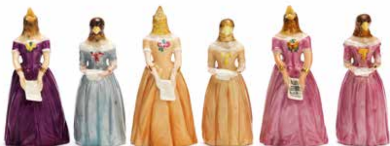
62 CONFIDENCE AND DIFFIDENCE: ELEVEN ROYAL WORCESTER EXTINGUISHERS Various dates, late 19th/20th century Representing the singer Jenny Lind, each with a bird's head and fully coloured, (11) £1,100 - 1,500 €1,200 - 1,700

See Bonhams.com for further footnote on this lot