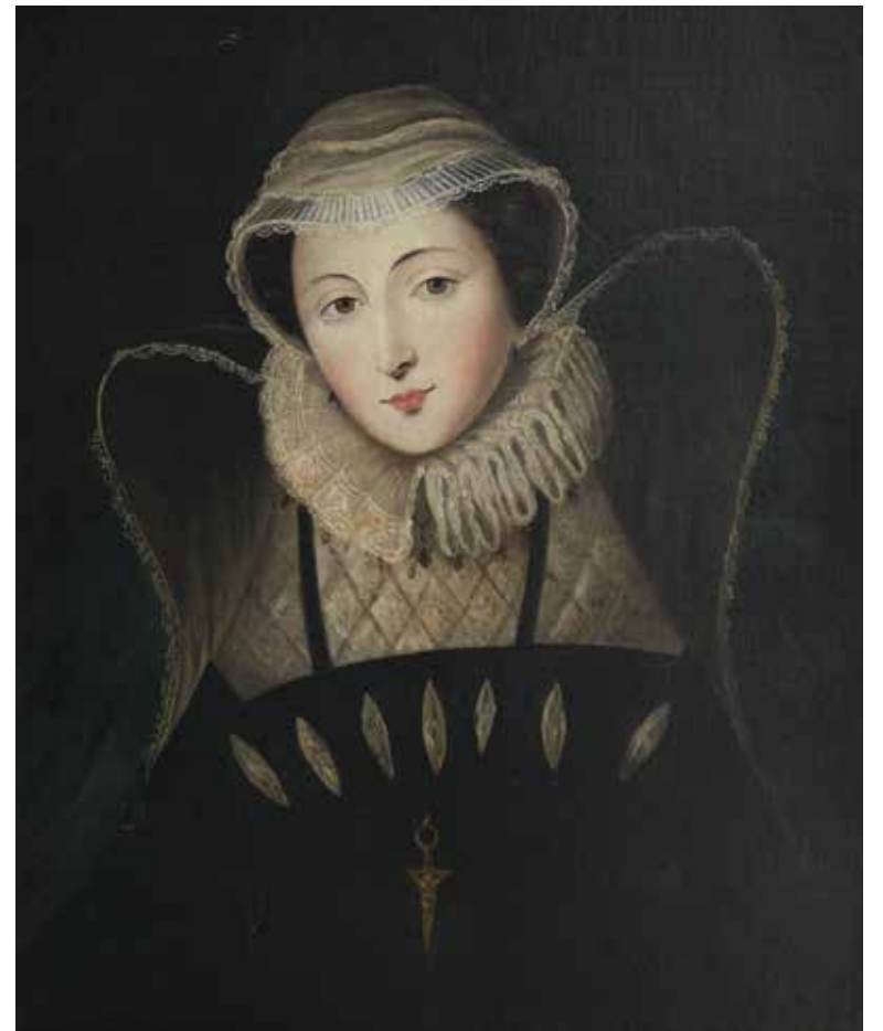
262 BRITISH SCHOOL (19TH CENTURY) Portrait of Mary Queen of Scots oil on canvas, 59 x 49cm (23 1/4 x 19 5/16in). £800 - 1,200 €900 - 1,400