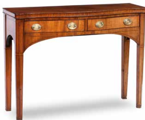
420 AN 18TH CENTURY AND LATER SERPENTINE SIDE TABLE The shaped top above two drawers raised on square tapering legs, 105cm wide, 37cm deep, 79cm high (41in wide, 14 1/2in deep, 31in high). £400 - 600 €450 - 680