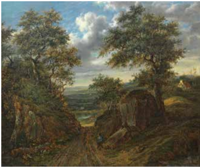
254 MANNER OF PATRICK NASMYTH Country Road bearing signature and date, oil on cradled panel, 45 x 60 cm. (17 11/16 x 23 5/8 in.) £200 - 300 €230 - 340

See Bonhams.com for further footnote on this lot