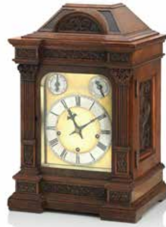
468 A LATE 19TH/EARLY 20TH CENTURY OAK CASED REPEATING BRACKET CLOCK

The movement stamped 'W. H. For Winterhalder & Hofmeyer'