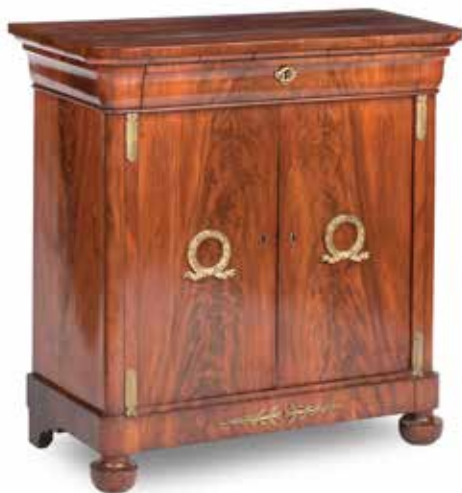
444 A LATE 19TH CENTURY FRENCH EMPIRE STYLE MAHOGANY AND GILT METAL MOUNTED SIDE CABINET The top with rounded ends above a single drawer and pair of cupboard doors raised on bun feet, 93cm wide, 44cm deep, 95cm high (36 1/2in wide, 17in deep, 37in high). £500 - 700 €560 - 790