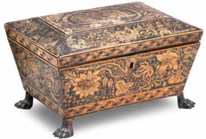
443 A REGENCY PENWORK TEA CADDY With brass paw feet decorated with foliate designs and chinoiserie scene, the interior converted to a work box with removable tray, 30cm wide, 21cm deep, 18cm high (11 1/2in wide, 8in deep, 7in high) £150 - 250 €170 - 280