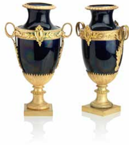
422 A PAIR OF MID 20TH CENTURY ORMOLU MOUNTED VASES Each with twin handles, raised on a square base, 29cm wide, 26cm deep, 50cm high (11in wide, 10in deep, 19 1/2in high) (2) £1,200 - 1,800 €1,400 - 2,000

See Bonhams.com for further footnote on this lot