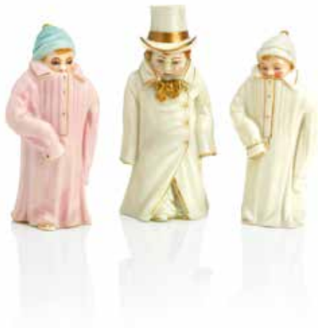
72 TODDIE AND BUDGE: THREE ROYAL WORCESTER EXTINGUISHERS FROM THE HELEN'S BABIES SERIES Comprising two examples of Toddie, one in pink with a pale blue hat, the other in gilt and tinted colouring, date codes for 1883 and 1890, Budge in gilt and tinted, 10.3cm-11.2cm high, factory marks £800 - 1,000 €900 - 1,100