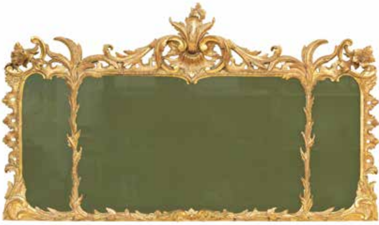
434 A 19TH CENTURY GILTWOOD AND GESSO OVERMANTLE MIRROR Of rectangular form with pierced and carved scrolling frame, the mirror plate formerly of three divisions, (mirror plates lacking), 113cm wide, 9cm deep, 70cm high (44in wide, 3 1/2in deep, 27 1/2in high). £1,000 - 1,500 €1,100 - 1,700