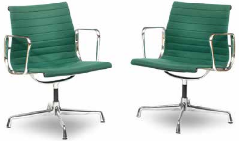
398 CHARLES AND RAY EAMES, A SET OF TEN ALUMINIUM GROUP CHAIRS Upholstered in ribbed green fabric, with chrome frame, and plastic slippers, inscribed to the underside '938-138', 59cm wide, 56cm deep, 84cm high (23in wide, 22in deep, 33in high). £2,000 - 3,000 €2,300 - 3,400