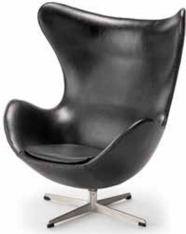
391 ARNE JACOBSEN (DANISH, 1902-1971) AN EGG CHAIR, DESIGNED 1958, MANUFACTURED BY FRITZ HANSEN Fibre-glass shell, foam, leather, steel swivel base 82cm x 73cm x 107cm £1,200 - 1,800 €1,400 - 2,000