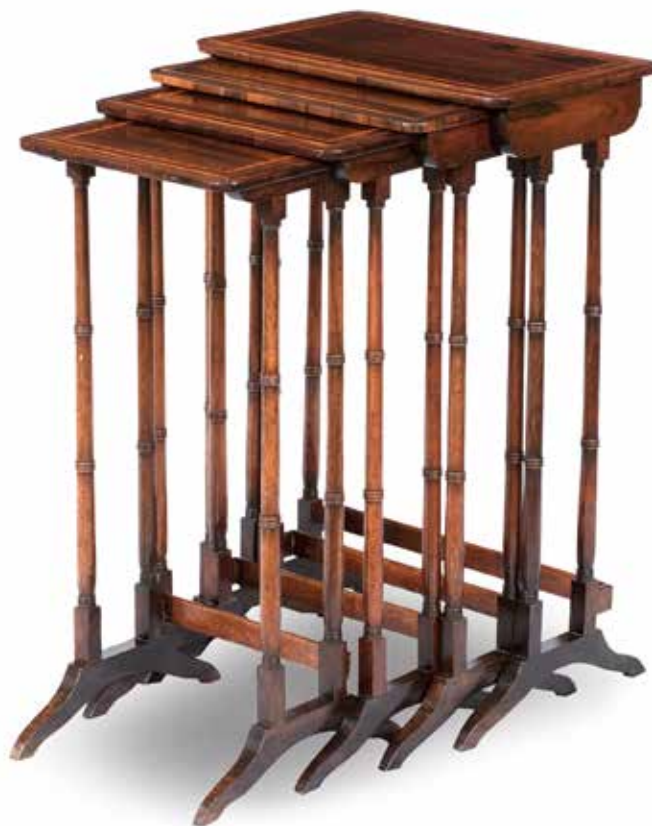
357 AN LATE 19TH/EARLY 20TH CENTURY QUARTETTO OF ROSEWOOD AND SATINWOOD BANDED TABLES Each raised on ring-turned legs with supports and stretchers, 47cm wide, 30cm deep, 75cm high (18 1/2in wide, 11 1/2in deep, 29 1/2in high). (4) £600 - 800 €680 - 900