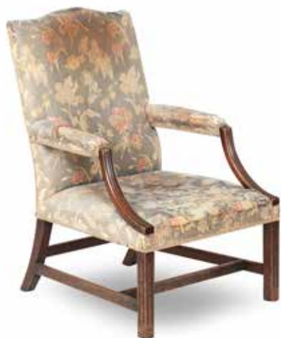
337 A GEORGE III MAHOGANY GAINSBOROUGH-TYPE OPEN ARMCHAIR The upholstered back with serpentine top, with outswept channel moulded arms with square section legs united by stretchers, together with another similar chair, raised on brass caps and castors, 65cm wide, 85cm deep, 100cm high (25 1/2in wide, 33in deep, 39in high). (2)