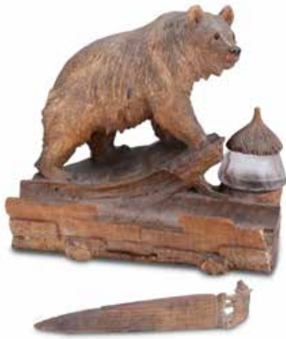
436 A BLACK FOREST CARVED WOODEN DESK STAND In the form of a bear standing beside a water trough, with a single glass inkwell, and carved paper knife 22cm wide, 11cm deep, 21cm high (8 1/2in wide, 4in deep, 8in high) £200 - 300 €230 - 340