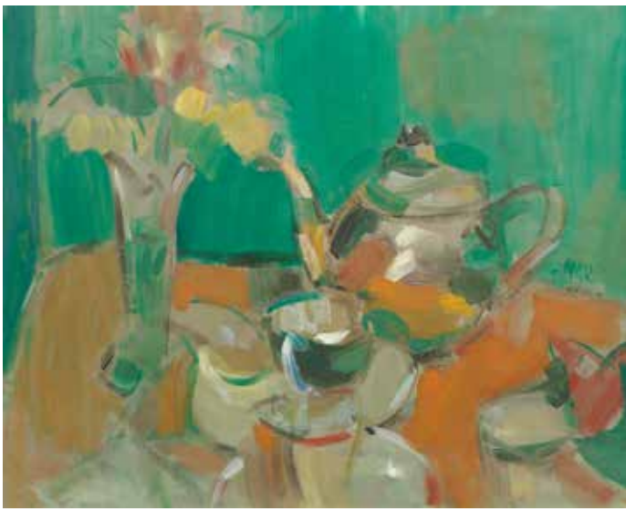
244 GORDON BRYCE RSA RSW (BRITISH, BORN 1943) AR Tea Time signed, further signed and titled verso, oil on board, 48.5 x 58.5cm (19 1/8 x 23 1/16in). £1,000 - 1,500 €1,100 - 1,700