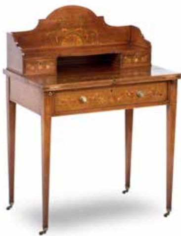
371 AN EARLY 20TH CENTURY SATINWOOD AND MARQUETRY INLAID SHERATON REVIVAL WRITING TABLE With raised super structure above two drawers, with fold-over writing surface, above a single drawer raised on square tapering legs on brass caps and castors, 77cm wide, 52cm deep, 107cm high (30in wide, 20in deep, 42in high). £400 - 600 €450 - 680