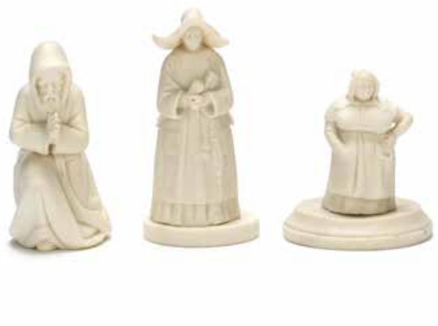
73 THE KNEELING MONK, SISTER OF CHARITY AND THE FRENCH COOK: THREE EARLY KERR AND BINNS PARIAN EXTINGUISHERS AND TWO STANDS Circa 1860 All in unglazed white porcelain revealing very detailed modelling, 6.5cm 9.9cm high £600 - 800 €680 - 900

See Bonhams.com for further footnote on this lot