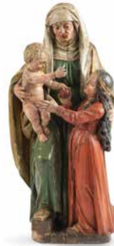
328 A LATE 18TH CENTURY POLYCHROME-PAINTED CARVED FIGURE GROUP, ST ANNE WITH THE VIRGIN & CHRIST , POSSIBLY ITALIAN OR GERMAN St Anne standing, the Virgin at her left side, the infant Christ resting on her right knee and held in her right arm, holding an apple, 47cm high (18 1/2in high) £300 - 500 €340 - 560