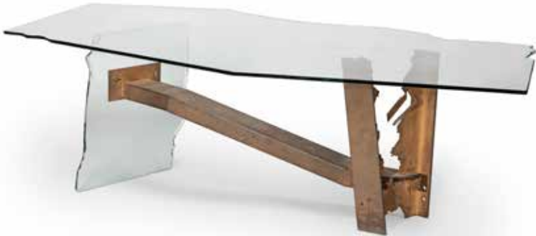
393 DANNY LANE (AMERICAN, B. 1955) RSJ TABLE DESIGNED 1985: A RARE RSJ TABLE DESIGNED IN 1985 FROM A SERIES OF 5 Glass, rolled steel joist 290cm x 139cm x 74cm Provenance: Acquired directly from Danny Lane. £1,500 - 5,000 €1,700 - 5,600