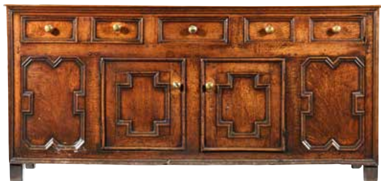
338 A WILLIAM & MARY JOINED OAK FULLY ENCLOSED DRESSER BASE, CIRCA 1690 The top of two boards, above three mitre-moulded drawers, and a pair of central cupboards doors flanked by a fixed panel, all with geometric mitre-mouldings, twin-panelled sides, on extended stile supports, 190.5cm wide, 48cm deep, 90cm high (75in wide, 18 1/2in deep, 35in high).