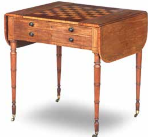
426 A 19TH CENTURY MAHOGANY AND CROSSBANDED GAMES TABLE The twin flap top with rounded corners and sliding reversible central chequer board, the interior with leather backgammon board, with one dummy and one drawer, raised on ring turned tapering legs with brass caps and castors, 75cm wide, 61cm deep, 74cm high (29 1/2in wide, 24in deep, 29in high). £400 - 600 €450 - 680