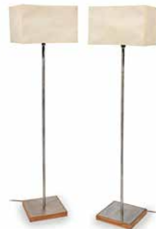
390 LINLEY A pair of floor lamps With paper shades, brushed-steel shafts and mounts, and walnut bases, 41cm wide, 31.5cm deep, 160cm high (16in wide, 12in deep, 62 1/2in high). £300 - 500 €340 - 560