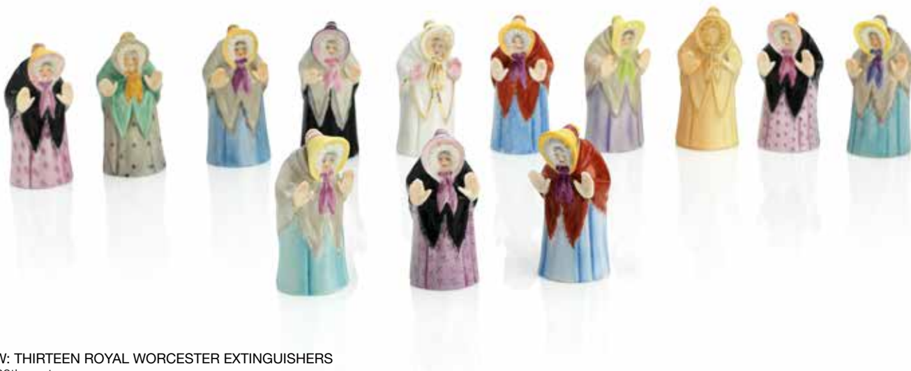
61 GRANNY SNOW: THIRTEEN ROYAL WORCESTER EXTINGUISHERS Late 19th/early 20th century In different colourways including one in blush ivory and one in gilt and tinted colouring, 7.7cm high, factory marks £300 - 500 €340 - 560