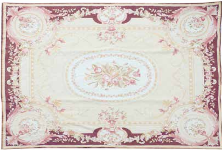
340 AN AUBOSSON STYLE WALL HANGING 225 x 293cm £300 - 500 €340 - 560