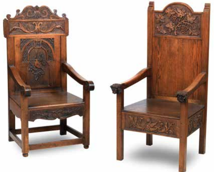
452 TWO LATE 19TH CENTURY OAK TWO PANEL BACKED ARM CHAIRS Each with carved top rail, raised on square supports, one example 61cm wide, 63cm deep, 123cm high (24in wide, 24 1/2in deep, 48in high). £200 - 300 €230 - 340

See Bonhams.com for further footnote on this lot