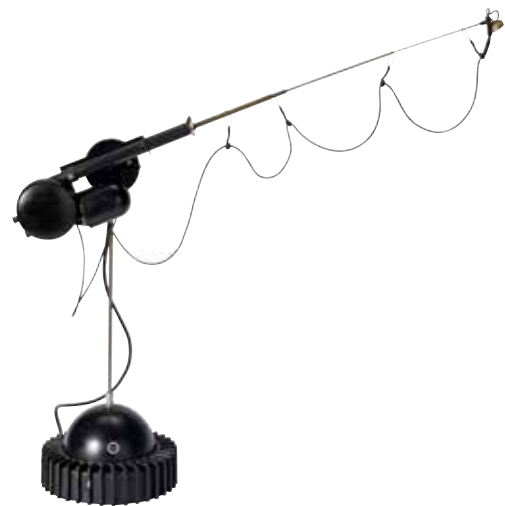
396 RON ARAD (ISRAELI/BRITISH) AERIAL TABLE LIGHT FOR ONE-OFF, DESIGNED 1982 aluminium, steel, wire 53cm x 20cm x 61cm £1,000 - 1,500 €1,100 - 1,700