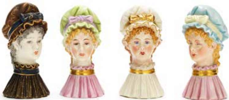
74 THE MOB CAP: FOUR ROYAL WORCESTER CANDLE EXTINGUISHERS Dated 1881 and 1891 Modelled by James Hadley in Kate Greenaway style as the head of a young lady, wearing a mob cap and a pleated collar, 9cm high, printed marks £900 - 1,300 €1,000 - 1,500

See Bonhams.com for further footnote on this lot