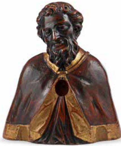
325 AN 18TH CENTURY POLYCHROME-PAINTED PINE RELIQUARY BUST, POSSIBLY ST. STEPHEN Wearing robes of red edged with gilt, an oval cavity in his chest for a relic, 48cm high (18 1/2in high) £400 - 600 €450 - 680