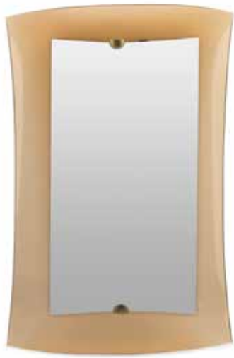
385 CRISTAL ARTE A wall mirror Model 2712 Opaque and mirrored glass, brass mounts £150 - 250 €170 - 280