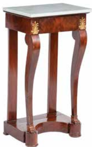
319 A 19TH CENTURY SMALL FRENCH EMPIRE STYLE HALL TABLE The top above a single drawer raised on ogee moulded legs with lion paw feet, raised on a plinth, 50cm wide, 36cm deep, 91cm high (19 1/2in wide, 14in deep, 35 1/2in high). £300 - 400 €340 - 450