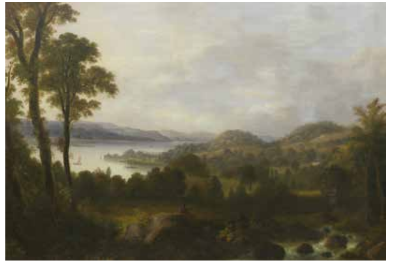
266 MANNER OF JOHN KNOX An extensive landscape, possibly Loch Lomond bearing another signature, oil on canvas, 61 x 85 cm. (24 x 33 7/16 in.) £200 - 300 €230 - 340