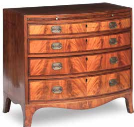
417 A REGENCY MAHOGANY AND BOXWOOD LINED BOWFRONT CHEST OF DRAWERS With dressing slide and four graduated drawers with brass swing handles, raised on outswept bracket feet, 91cm wide, 56cm deep, 85cm high (35 1/2in wide, 22in deep, 33in high). £400 - 600 €450 - 680