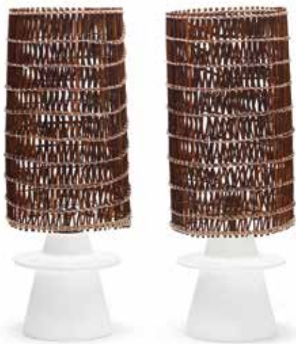
395 STYLE OF GIACOMETTI FOR JEAN MICHEL FRANK A pair of table lamps Painted terracotta, basket woven shades 18cm diameter 49cm high £1,500 - 2,000 €1,700 - 2,300