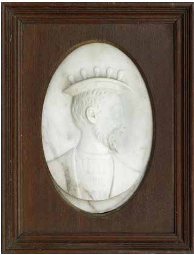
One of a pair shown