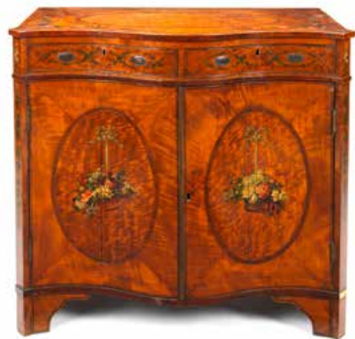
439 A GEORGE III SATINWOOD, ROSEWOOD AND LATER POLYCHROME PAINTED SIDE CABINET Of serpentine form, the pair of doors enclosing one shelf, area lacking to the interior, and the decoration probably Edwardian, 92cm wide, 57cm deep, 88.5cm high (36in wide, 22in deep, 34 1/2in high). £700 - 1,000 €790 - 1,100