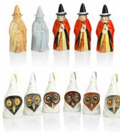
65 THE WITCH AND THE OWL: ELEVEN ROYAL WORCESTER EXTINGUISHERS Late 19th/early 20th century Five examples of the Witch including one in blush ivory and one in pale blue-tinted biscuit porcelain, the six Owls with coloured faces, 8.5cm - 10cm high, factory marks £300 - 500 €340 - 560