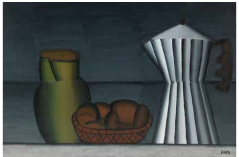
244A JACK KNOX, RSA RSW RGI (BRITISH, BORN 1936) AR Still life with Coffee Pot, Croissants and Jug signed, oil on canvas, 51 x 77 cm. (20 1/16 x 30 5/16 in.) £800 - 1,200 €900 - 1,400

See Bonhams.com for further footnote on this lot