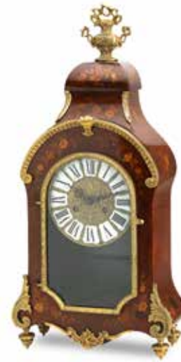
470 A 19TH CENTURY STYLE INLAID MAHOGANY AND GILT METAL MOUNTED MANTEL CLOCK, MID 20TH CENTURY