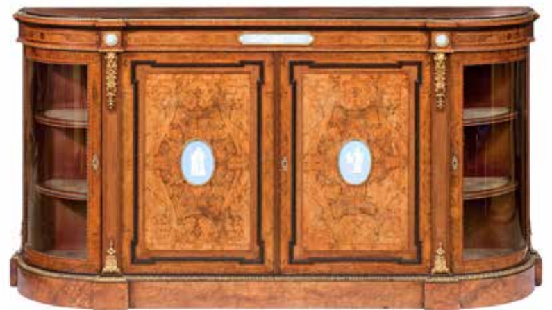
445 A 19TH CENTURY WALNUT, ROSEWOOD AND PORCELAIN MOUNTED CREDENZA The shaped top above a pair of cupboard doors, flanked by a pair of bowfronted glazed doors enclosing shelves mounted with Wedgwood style plaques, raised on a plinth, 185cm wide, 45cm deep, 101cm high (72 1/2in wide, 17 1/2in deep, 39 1/2in high). £2,000 - 3,000 €2,300 - 3,400