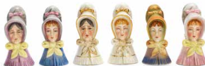
63 OLD WOMAN AND YOUNG GIRL: TWO PAIRS OF ROYAL WORCESTER CANDLE EXTINGUISHERS AND TWO OTHERS Dated 1880, 1884 and 1899 Modelled by James Hadley in Kate Greenaway style, wearing bonnets tied with large bows and shawls with pleated hems, 8.9-9.2cm high, printed marks £1,200 - 1,500 €1,400 - 1,700

See Bonhams.com for further footnote on this lot