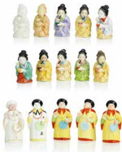
64 THE JAPANESE GIRL AND THE MANDARIN: FIFTEEN ROYAL WORCESTER EXTINGUISHERS Late 19th/early 20th century Comprising ten Japanese Girls including one in parian and one in blush ivory, the rest fully coloured, the five Mandarins including one with gilding and one colour standard, 7.5cm - 11cm high, factory marks £400 - 600 €450 - 680

See Bonhams.com for further footnote on this lot