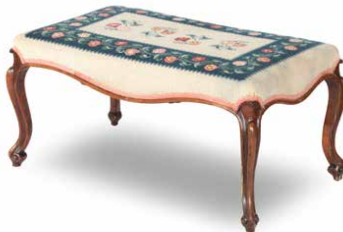
418 A LARGE 19TH CENTURY ROSEWOOD CENTRE STOOL Y With tapestry stuff over seat, raised on carved cabriole legs and scrolling feet, 94cm wide, 57cm deep, 46cm high (37in wide, 22in deep, 18in high). £300 - 400 €340 - 450