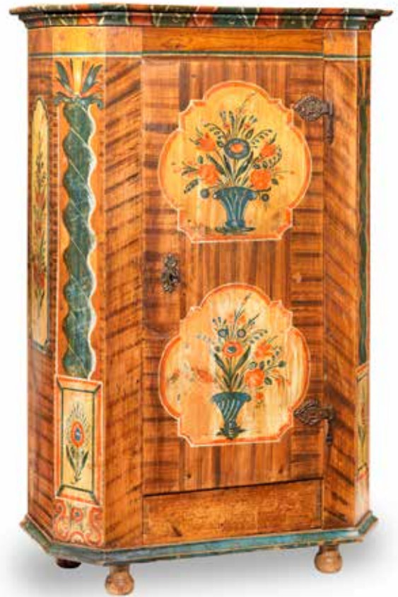
450 A 19TH CENTURY PINE POLYCHROME-PAINTED ARMOIRE, CENTRAL EUROPEAN, CIRCA 1840 With moulded cornice, the single door decorated with two shaped reserves of flower-filled vases, against a faux-grain ground, the canted front corners painted with spiral-turned columns, each side again with floral reserves, the interior fitted with three shelves, on bun feet, 113cm wide, 52cm deep, 174.5cm high (44in wide, 20in deep, 68 1/2in high). £400 - 600 €450 - 680