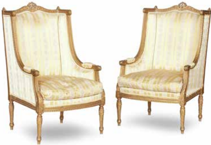
423 A PAIR OF FRENCH LATE 19TH/EARLY 20TH CENTURY GILT PAINTED ARM CHAIRS The carved top rail above an upholstered striped fabric back and seat, between acanthus carved arms, raised on turned tapering legs, 66cm wide, 57cm deep, 107cm high (25 1/2in wide, 22in deep, 42in high). £500 - 700 €560 - 790