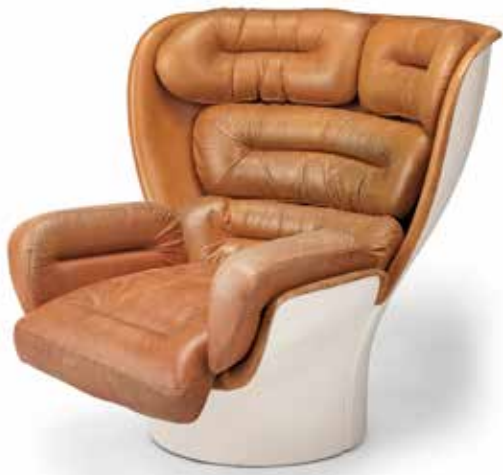
397 JOE COLOMBO (ITALIAN, 1930-1971), ELDA CHAIR DESIGNED 1963 FOR COMFORT Fibre-glass shell, tan leather upholstery 94 x 100cm. £800 - 1,200 €900 - 1,400