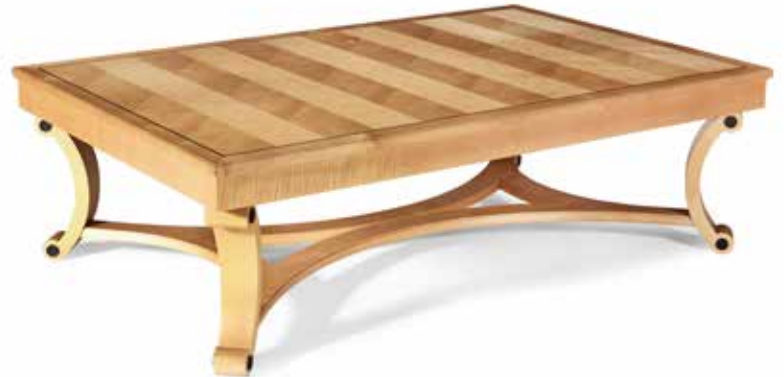
394 LINLEY A rippled-sycamore low table The chevron-banded top within an ebony-strung border on sabre legs united by concave stretchers, 140cm wide, 90cm deep, 43cm high (55in wide, 35in deep, 16 1/2in high). £300 - 500 €340 - 560