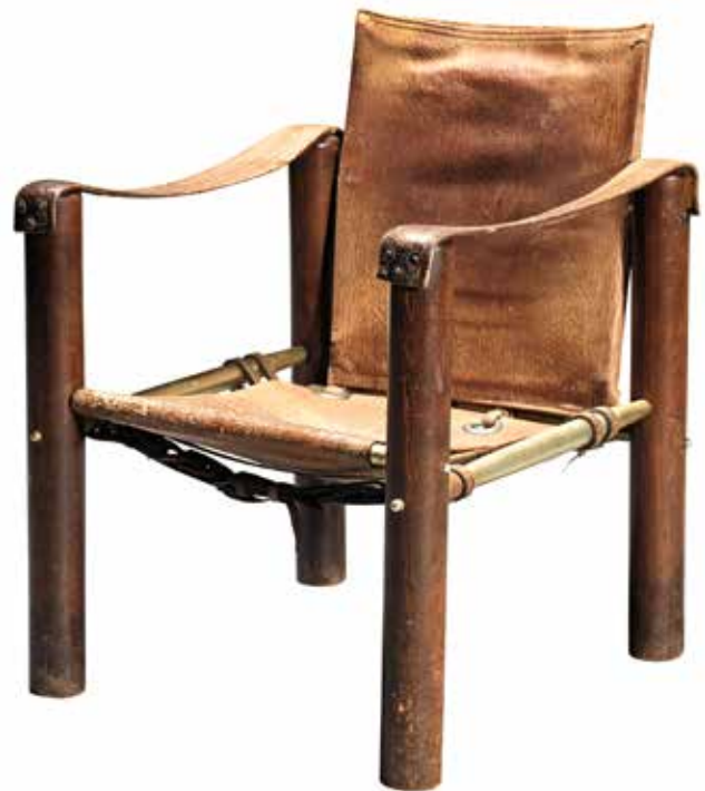
384 ATTRIBUTED EILEEN GRAY, A LABOURDETTE ARMCHAIR, DESIGNED C.1923 THIS EXAMPLE PROBABLY EXECUTED 1930S Oak, anodised aluminium torpedo-shaped rails with matt-gold finish, thick tan leather hide with metal hoops and canvas backing, 58cm wide, 56.5cm deep, 74.5cm high (22 1/2in wide, 22in deep, 29in high). £4,000 - 6,000 €4,500 - 6,800

See Bonhams.com for further footnote on this lot