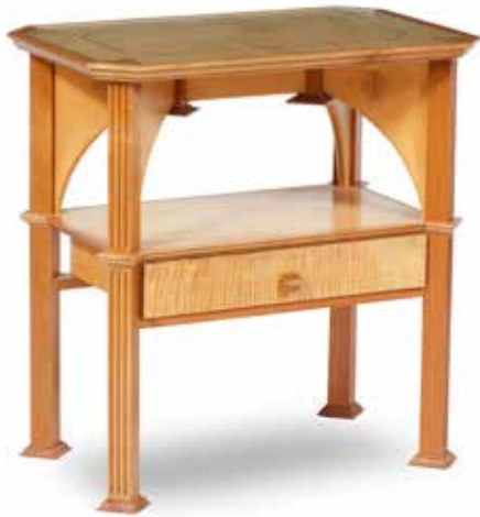
399 A CONTEMPORARY SYCAMORE AND INLAID SIDE TABLE The top with canted corners above an undertier fitted with a drawer raised on square fluted legs, with moulded feet, 71cm wide, 46cm deep, 73cm high (27 1/2in wide, 18in deep, 28 1/2in high). £500 - 700 €560 - 790