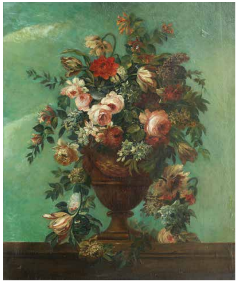
259 FRENCH SCHOOL, 20TH CENTURY Urn of flowers oil on canvas, 109 x 89cm (42 15/16 x 35 1/16in). £600 - 800 €680 - 900