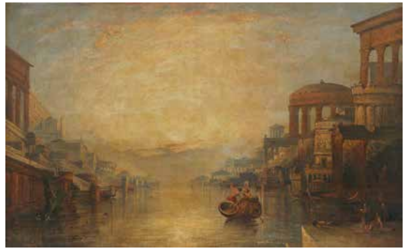
264 ENGLISH SCHOOL (19TH CENTURY) A capriccio of a river with classical architecture oil on canvas, unframed, 62 x 96.5cm (24 7/16 x 38in). £800 - 1,200 €900 - 1,400