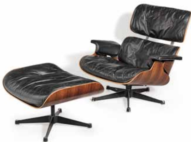
389 CHARLES (AMERICAN, 1907-1978) AND RAY (AMERICAN, 1912-1988) EAMES Y A 670 LOUNGE CHAIR AND 671 OTTOMAN, DESIGNED 1956, PROBABLY MANUFACTURED HILLE Bent plywood, rosewood veneer, steel, leather, the metal base of the chair stamped EIII, the metal base of the stool stamped 670c, the chair, 84cm wide, 85cm deep, 84cm high (33in wide, 33in deep, 33in high). £1,500 - 2,000 €1,700 - 2,300