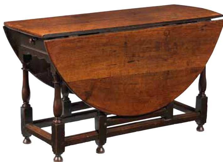
336 A QUEEN ANNE JOINED OAK GATELEG DINING TABLE, CIRCA 1710 Having an oval drop-leaf top, and a single lip-moulded end-frieze drawer, above an ogee-shaped apron, raised on baluster-turned legs and conforming gates, the rectangular stretchers with upper moulded edges, on turned feet, 146cm wide, 129cm deep, 73.5cm high (57in wide, 50 1/2in deep, 28 1/2in high).