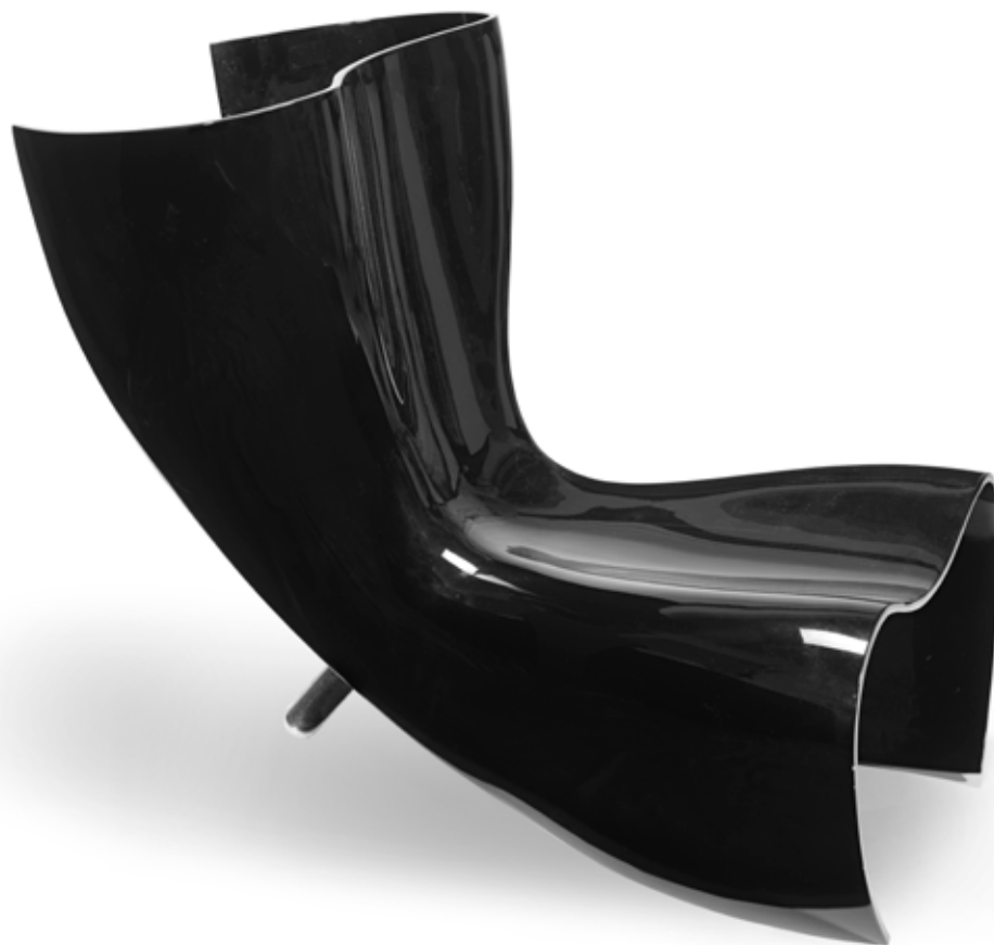
403 MARC NEWSON (AUSTRALIAN, B. 1963) FELT CHAIR , DESIGNED 1998, MANUFACTURED BY CAPELLINI , ITALY Black lacquered fibreglass, tubular steel 66cm x 95cm x 82cm £1,200 - 1,800 €1,400 - 2,000