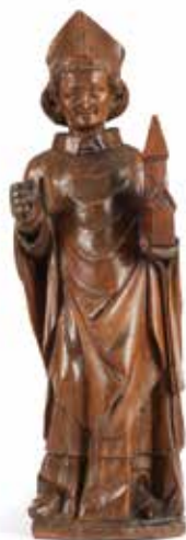
329 AN 18TH CENTURY CARVED WALNUT FIGURE OF A MALE SAINT, POSSIBLY ST ELIGIUS , GERMAN OR FRENCH Modelled wearing a mitre, a church in the palm of his left hand, the attribute once in his right hand now lacking, 71cm high (27 1/2in high) £500 - 800 €560 - 900