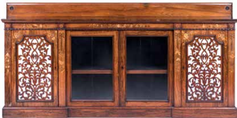
438 A 19TH CENTURY ROSEWOOD AND INLAID LIBRARY CABINET The top with raised gallery above glazed cupboard doors enclosing shelves, flanked by pierced and inlaid cupboard door backed in silk, on a plinth, 239cm wide, 42cm deep, 114cm high (94in wide, 16 1/2in deep, 44 1/2in high). £500 - 800 €560 - 900