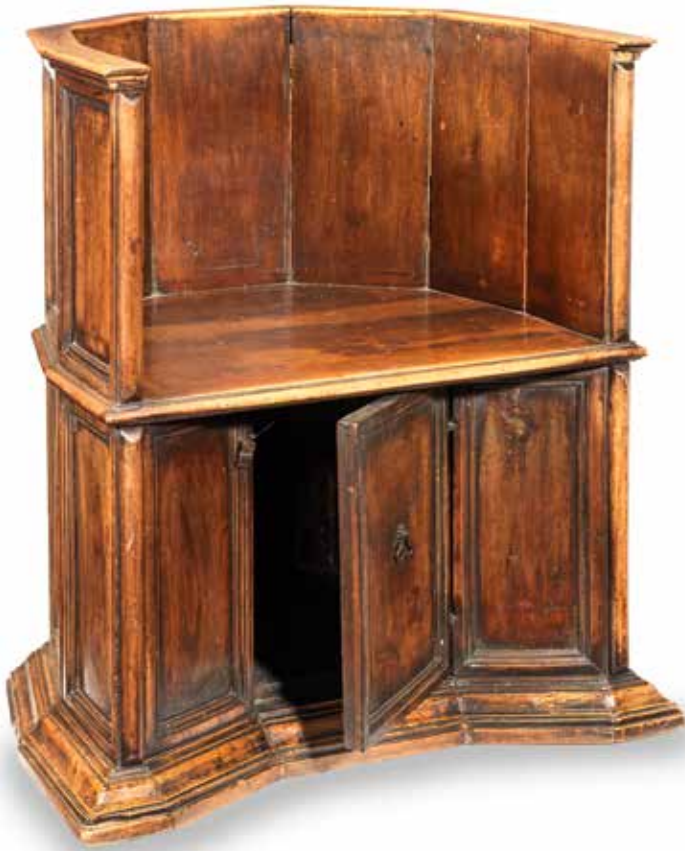
449 AN ITALIAN BOARDED WALNUT 'SEDILE A POSSETTO', IN THE 16TH CENTURY TUSCAN MANNER Possibly incorporating some period timbers, with seven-sided back, with moulded frame to outer face, a recessed central cupboard below the seat with deep base mouldings, 59.5cm wide, 51cm deep, 78.5cm high (23in wide, 20in deep, 30 1/2in high). £500 - 800 €560 - 900