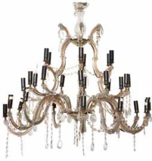
440 A MID-20TH CENTURY GILT METAL AND MOULDED GLASS CHANDELIER With thirty light fittings, with scrolling arms and drops, 90cm in diameter, 136cm high (35in in diameter, 53 1/2in high). £800 - 1,200 €900 - 1,400