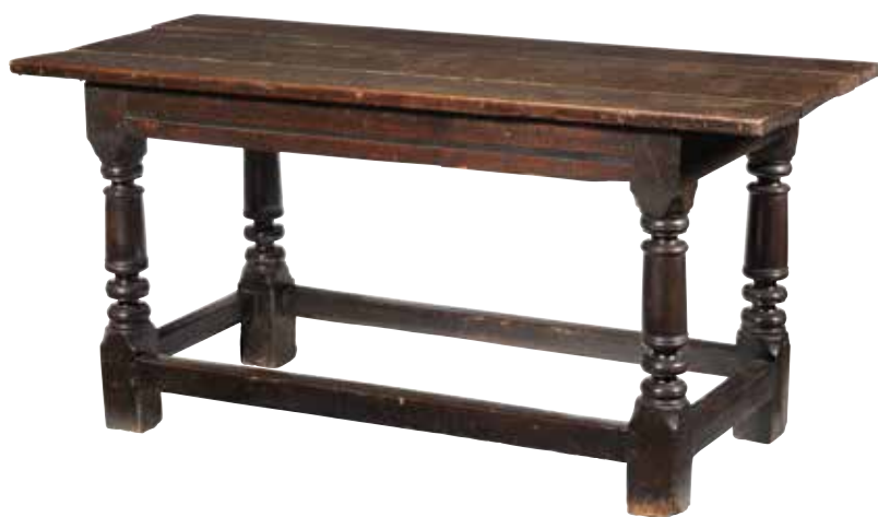
358 A CHARLES II JOINED OAK 'REFECTORY-TYPE' TABLE, CIRCA 1660 The top of four thick boards, all rails with single black-stained flat run-moulding, on tapering columnar and ring-turned legs with plain stretchers with an accentuated chamfered inner lower edge, 170.5cm wide, 72.5cm deep, 81.5cm high (67in wide, 28 1/2in deep, 32in high). £700 - 1,000 €790 - 1,100

See Bonhams.com for further footnote on this lot