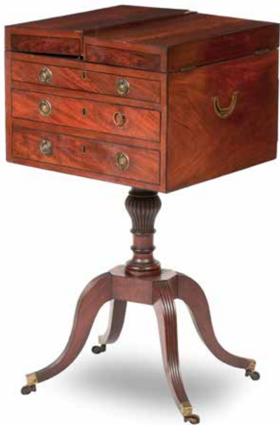
356 A GEORGE III MAHOGANY GENTLEMAN'S DRESSING STAND With hinged top enclosing a green baize surface above two drawers raised on central column base with four outswept legs, on brass caps and castors, 51cm wide, 46cm deep, 95cm high (20in wide, 18in deep, 37in high). £600 - 800 €680 - 900