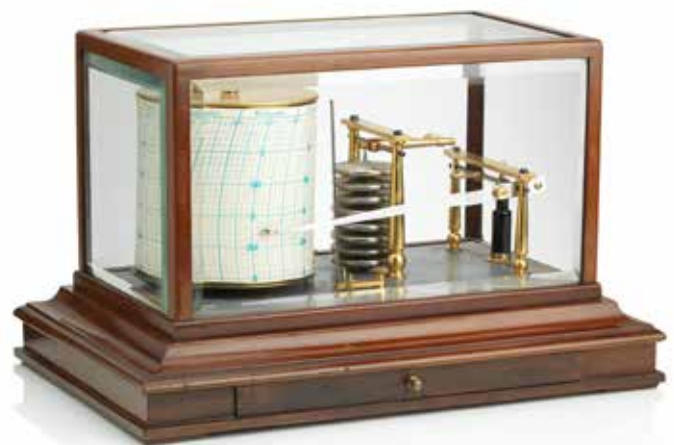
472 A LATE 19TH/EARLY 20TH CENTURY MAHOGANY CASED OVERSIZED BAROGRAPH

With eight tier bellows, lacquered brass, contained with a mahogany case with bevelled glass plates raised on a moulded plinth with single drawer, 47cm wide, 30cm high, 30cm deep, (18 1/2in wide, 11 1/2in deep, 11 1/2in high)