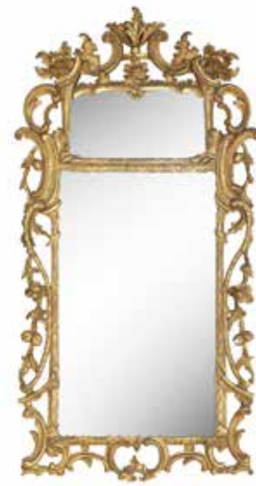
316 A GEORGE III GILTWOOD AND GESSO WALL MIRROR IN THE ROCOCO STYLE The pierced and carved frame with foliage and fruit, with two mirrored plates, 71cm wide, 5cm deep, 146cm high (27 1/2in wide, 1 1/2in deep, 57in high). £2,500 - 3,500 €2,800 - 3,900