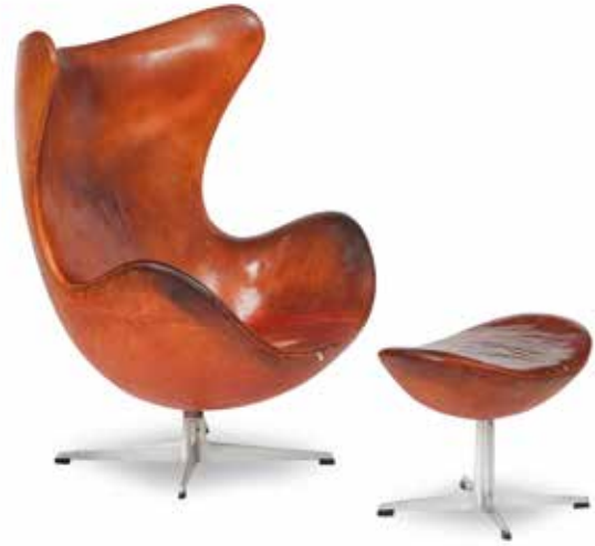
392 ARNE JACOBSEN (DANISH, 1902-1971) AN EGG CHAIR AND STOOL, DESIGNED 1958, MANUFACTURED BY FRITZ HANSEN Fibre-glass shell, foam, tan-leather, steel swivel base, by repute this chair and stool were acquired pre-1960, 82cm wide, 73cm deep, 107cm high (32in wide, 28 1/2in deep, 42in high). £3,000 - 5,000 €3,400 - 5,600