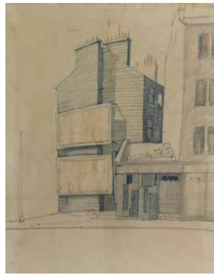
274 ALASDAIR GRAY (BRITISH, BORN 1934) AR Glasgow tenement ink and pencil on brown paper, 45.5 x 37cm (17 15/16 x 14 9/16in). £100 - 150 €110 - 170