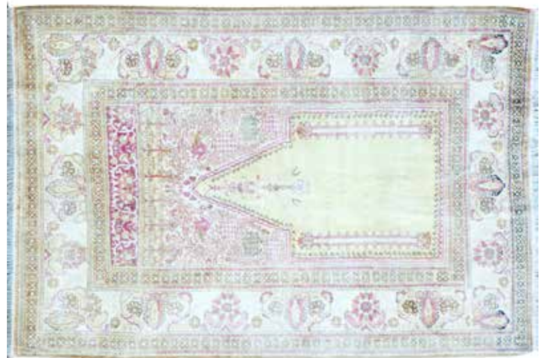
343 A PERSIAN SILK RUG 121 x 179cm

See Bonhams.com for further footnote on this lot