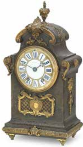
469 A LATE 19TH CENTURY BOULLE MATEL CLOCK

The dial inscribed J. Howell & Co., Paris