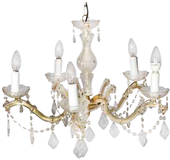
315 A FIVE-BRANCH MOULDED-GLASS CHANDELIER With cartouche-shaped pendants and trailing swags, and a large mirrored-paper shade, the chandelier 48cm high (18 1/2in high). £150 - 250 €170 - 280