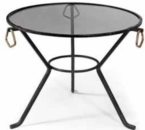
388 ATTRIBUTED TO JACQUES ADNET (FRENCH 1900-1984) AN OCCASIONAL TABLE Iron frame with angular brass handles, glass, 59cm in diameter, 45cm high (23in in diameter, 17 1/2in high). £400 - 600 €450 - 680