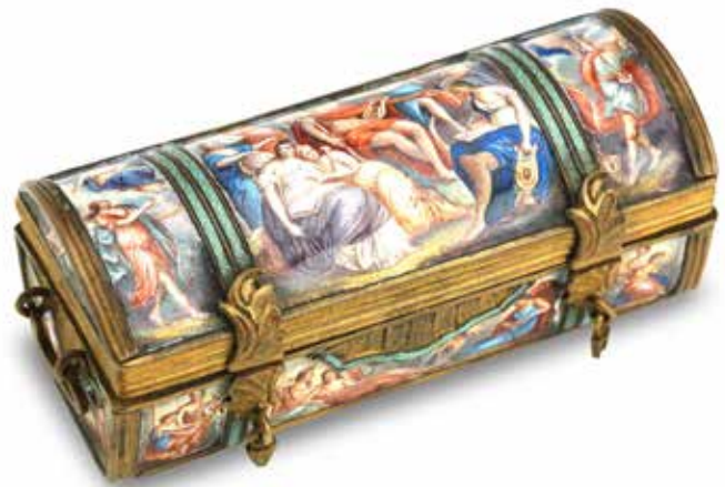
437 A LATE 19TH/EARLY 20TH CENTURY VIENNESE GILT METAL AND ENAMEL CASKET All over decorated with classical scenes, with gilt metal swing handles, the interior with turquoise enamel and gilt stars, 8.5cm wide, 3.5cm deep, 3.5cm high (3in wide, 1in deep, 1in high) £300 - 500 €340 - 560