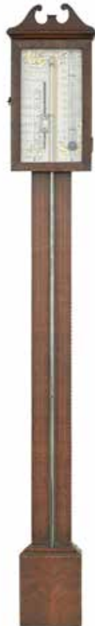
479 A GEORGE III MAHOGANY STICK BAROMETER Inscribed Collins Fecit, Paisley With visible tube and adjustable Vernier and alcohol thermometer, painted dial with swan neck pediment, above a rectangular trunk and cistern 15cm wide, 6cm deep, 99cm high, (5 1/2in wide, 2 in deep, 38 1/2in high) £200 - 400 €230 - 450