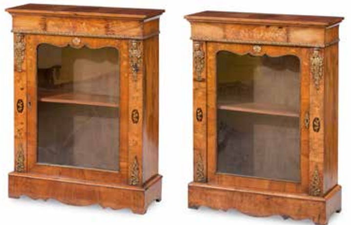
372 A PAIR OF LATE 19TH CENTURY WALNUT, MARQUETRY, AND GILT METAL MOUNTED DISPLAY CABINETS Each with glazed door enclosed shelves raised on a plinth, 83cm wide, 32cm deep, 110cm high (32 1/2in wide, 12 1/2in deep, 43in high). £800 - 1,200 €900 - 1,400