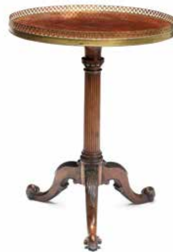
320 A 19TH CENTURY GEORGE III STYLE CARVED MAHOGANY TRIPOD TABLE With a pierced brass gallery (possible alterations) the underside bearing the printed paper label 'Jeffrey, Sons & Co. Ltd./HOUSE FURNISHERS/ NORTHAMPTON/ C2587', 61cm in diameter, 79cm high (24in in diameter, 31in high). £300 - 500 €340 - 560