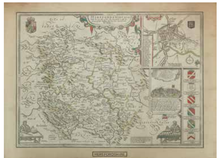
284 BRITISH SCHOOL 7 Miscellaneous antique maps, mostly UK counties (damages) £300 - 500 €340 - 560