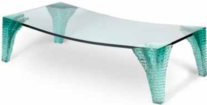
387 DANNY LANE (AMERICAN, B. 1955) AN ATLAS COFFEE TABLE, MANUFACTURED BY FIAM Glass, concave top, stacked legs 140cm x 70cm x 38cm £1,500 - 2,000 €1,700 - 2,300