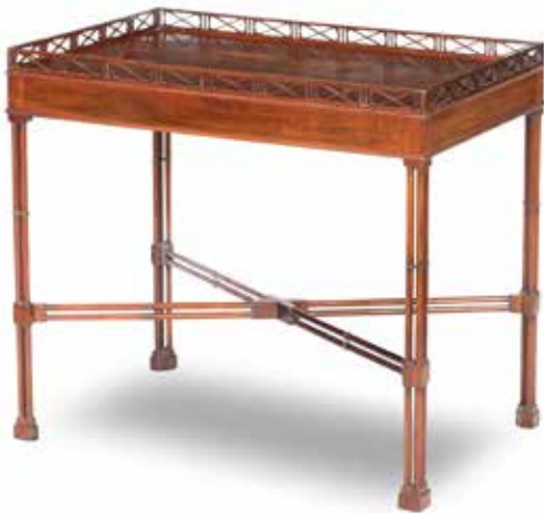
425 A MID-20TH CENTURY GEORGE III STYLE MAHOGANY SILVER TABLE The top with pierced gallery raised on turned cluster column supports with corresponding X-stretcher, 83cm wide, 54cm deep, 74cm high (32 1/2in wide, 21in deep, 29in high). £400 - 600 €450 - 680