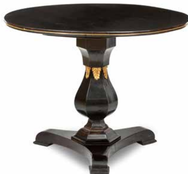
359 A 19TH CENTURY AND LATER GILT METAL MOUNTED EBONISED CENTRE TABLE The top raised on a hexagonal bulbous column with trefoil base with plinth feet, 95cm in diameter, 72cm high (37in in diameter, 28in high). £500 - 800 €560 - 900

See Bonhams.com for further footnote on this lot