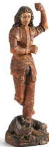
330 A LATE 17TH/EARLY 18TH CENTURY POLYCHROME-PAINTED PINE FIGURE ST GEORGE & THE DRAGON , POSSIBLY GERMAN Wearing armour, the dragon beneath St George's feet, lacking lance, 43.5cm high (17in high) £400 - 600 €450 - 680