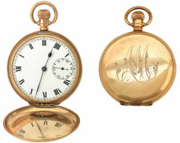
478 A 9CT GOLD HUNTER POCKET WATCH BIRMINGHAM 1920 The white enamel dial with Roman numerals and subsidiary seconds dial, the seven jewel movement stamped 'Warranted English, with lever escapement, 4.9mm diameter £400 - 600 €450 - 680