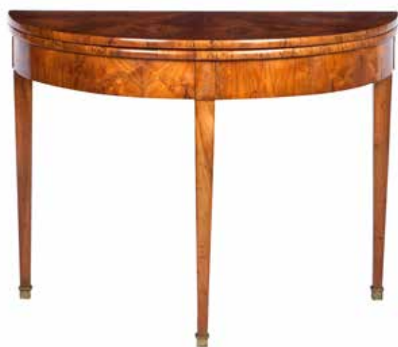
419 A LATE 19TH/EARLY 20TH CENTURY BURR WALNUT DEMI-LUNE TEA TABLE The D-shaped fold over top with radiating veneers, raised on square tapering legs with brass caps, 97cm wide, 49cm deep, 74cm high (38in wide, 19in deep, 29in high). £200 - 300 €230 - 340