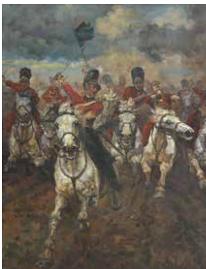
250 AFTER ELIZABETH SOUTHERDEN (LADY BUTLER) THOMPSON (MODERN COPY)

AR The debutante signed, oil on canvas, 55 x 44cm (21 5/8 x 17 5/16in). £400 - 600 €450 - 680