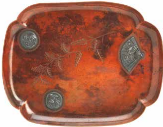
442 AN AESTHETIC MOVEMENT COPPER AND OVERLAID TRAY, BY GORHAM & CO. Stamped to the base 'Gorhamd Co. B65' of lobed form, 19.5cm wide, 15.5cm deep, 1.5cm high (7 1/2in wide, 6in deep, 0 1/2in high) £600 - 800 €680 - 900