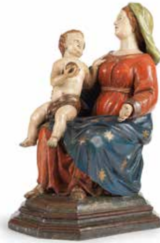
326 A LATE 18TH/EARLY 19TH CENTURY POLYCHROME-DECORATED CARVED SCULPTURE, THE VIRGIN & CHILD , SOUTH EUROPEAN The Virgin seated, and wearing a blue cloak painted with gilt stars over a red dress, the infant Christ on her right knee, holding a golden orb, on a moulded octagonal base, 56.5cm high (22in high) £300 - 500 €340 - 560