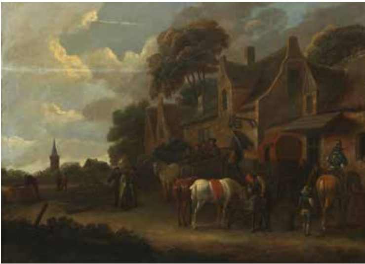
265 MANNER OF KLAES MOLENAER Travellers outside an inn oil on panel, 38 x 56cm (14 15/16 x 22 1/16in). £1,200 - 1,500 €1,400 - 1,700