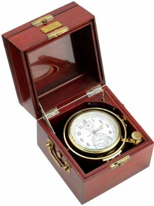
477 A MODERN RUSSIAN 56 HOUR MARINE CHRONOMETER XPOHOMETP MOPCKON TV 25-07 1533-84 The 4in. dial with Arabic numerals, single chain driven movement, the double case with brass gimbal and carrying handles, serial no. 18838 (with winder) 19cm wide, 19cm deep, 19.5cm high, (7in wide, 7in deep, 7 1/2in high) £400 - 600 €450 - 680