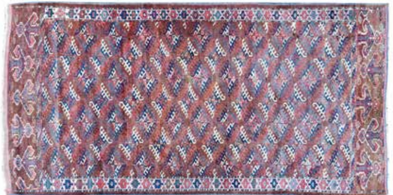
345 A TURKOMAN CARPET Together with a Bokhara rug, and an Afghan rug (3) 164cm x 296cm £300 - 400 €340 - 450