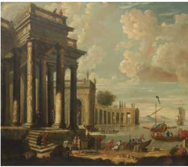
263 FOLLOWER OF ZOCCHI (ITALIAN), 18TH CENTURY Port with classical architecture oil on canvas, 102.5 x 127cm (40 3/8 x 50in). £2,000 - 3,000 €2,300 - 3,400