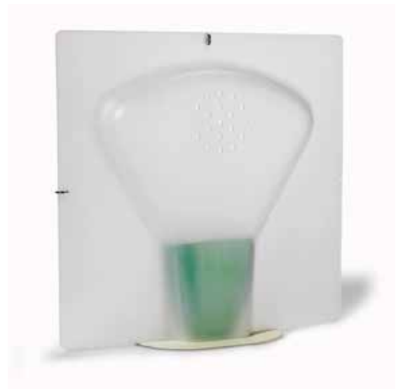
386 ITALIAN, TABLE LAMP, DESIGNED AND MANUFACTURED LATE 1980S Opaque plastic with metal clips £1,500 - 2,000 €1,700 - 2,300